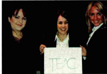
PlaceWright Design Studio's team at William Hezmalhalch Architects: received design award for Teac Structural Engineering logo

PlaceWright Design Studio at William Hezmalhalch Architects received the STEP Inside Design Reader's Choice Award for the logo design of Teac Structural Engineering. The logo is among 100 chosen out of more than 3,000 entries. Voting for the top five finalists will continue through January.